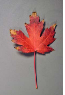
Simple leaf- one leaf per bud