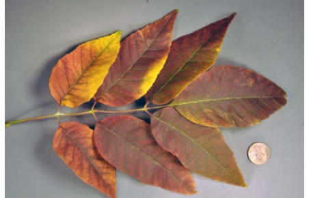
Pinnately Compound Leaf- Leaflets arranged like a feather

Ash - Green and White Ash and their clones are most common- all of which are susceptible to Emerald Ash Borer. In some parts of the state Boxelder is also a possibility (see page 2).