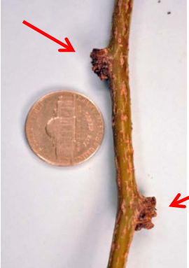
Alternate leaf arrangement

Not an Ash - Oaks, Lindens, Hackberries, Elms, Poplars, Cottonwoods, Legumes, Catalpas, Apples, Pears and Stone Fruits, Walnuts, Mt. Ashes (not true Ashes)