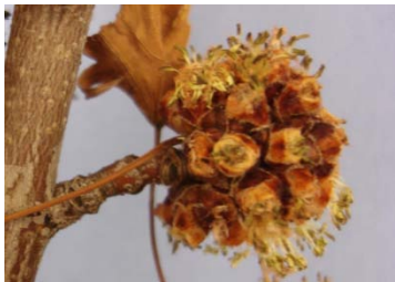
Clustered flower buds of Silver Maple

2) Twig covered in white wax which can be rubbed off revealing a olive green to purple color depending on the time of year Double samara fruit in "chains"