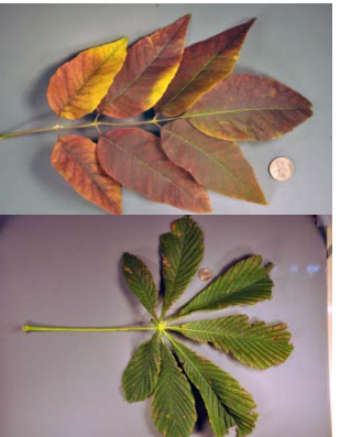
Compound leaf- multiple leaflets per bud

Ashes, Buckeyes\Horsechestnuts and Boxelder