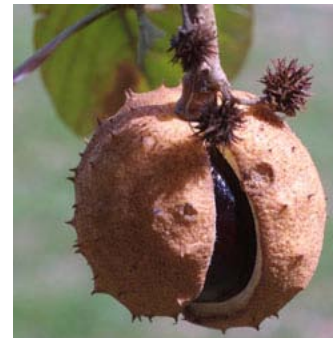
Fruit of Ohio Buckeye

4) Terminal bud covered in short hairs (velveteen) and chocolate to dark brown. Dry fruit with single wing (single samara)