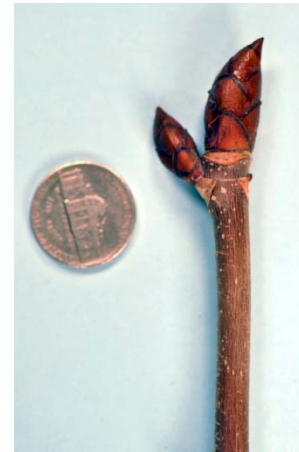
Terminal bud of Common Horsechestnut