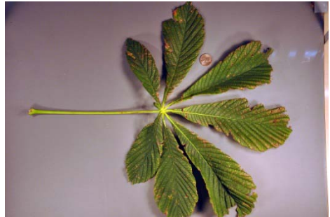
Palmately Compound Leaf- Leaflets arranged like fingers on a hand