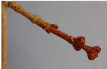
Autumn Blaze Maple Buds

Double samara fruit of Maples (Note: size of fruit and angle of wings varies with species).