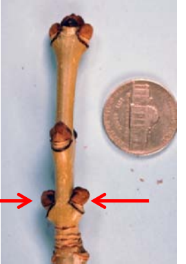
Opposite leaf arrangement

Ashes, Maples, and Buckeyes\ Horsechestnuts